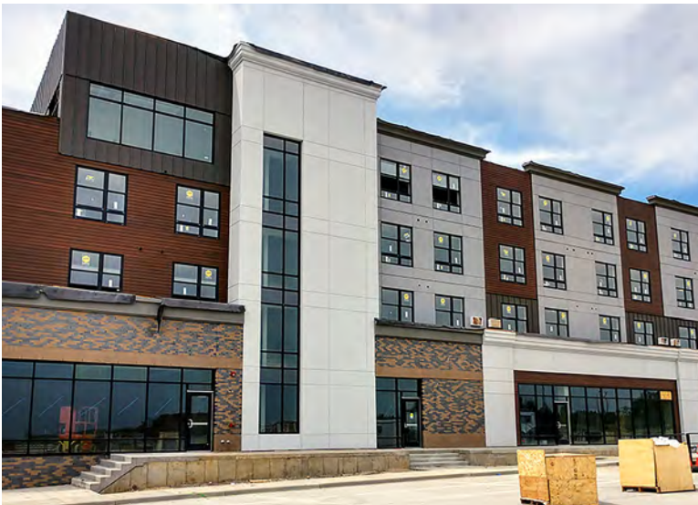
Construction progress picture June. 2020

AREA 57 will serve as a multi-purpose environment where living, shopping, working, playing and socializing coexist. The first phase of AREA 57 is buildings C and D. Building C will have 27 apartments, both 1 and 2-story units, and 12,746 sf of commercial space. Building D will have 25 apartments and 8,728 sf of commercial space. Some property highlights include an outdoor programmable park, health and wellness focused businesses along with a mix of retail to support the residential and commercial tenants. The buildings will have an attractive and modern design. AREA 57 will be a prominent building complex that will give Bismarck residents an area where people can work, live, and play.