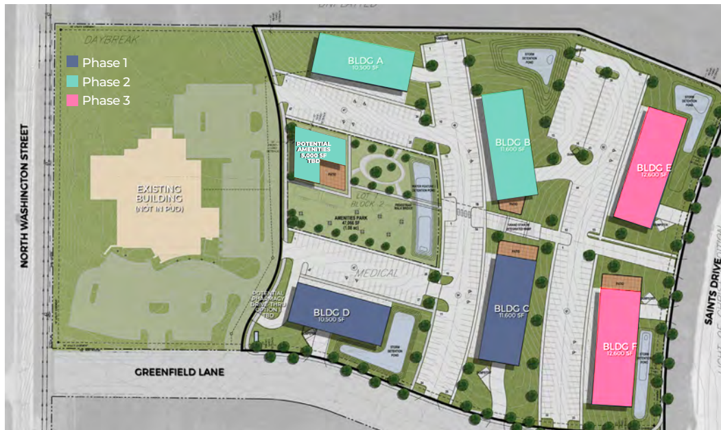
Right between the Bismarck Surgical Associates Center and Light of Christ High Schools