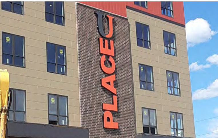
UJ Place as of August 2020

The area of Jamestown where UJ Place is being developed is a high-traffic part of town. This is due to the neighboring high school, vocational school, TRACS, airport and Collins Aerospace within the vicinity. In addition, there is an increasing residential population that is in need for retail services. UJ Place is an exciting development that will create a walkable and lively district to the University of Jamestown and Jamestown as a whole.