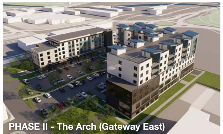
PHASE II - The Arch (Gateway East)