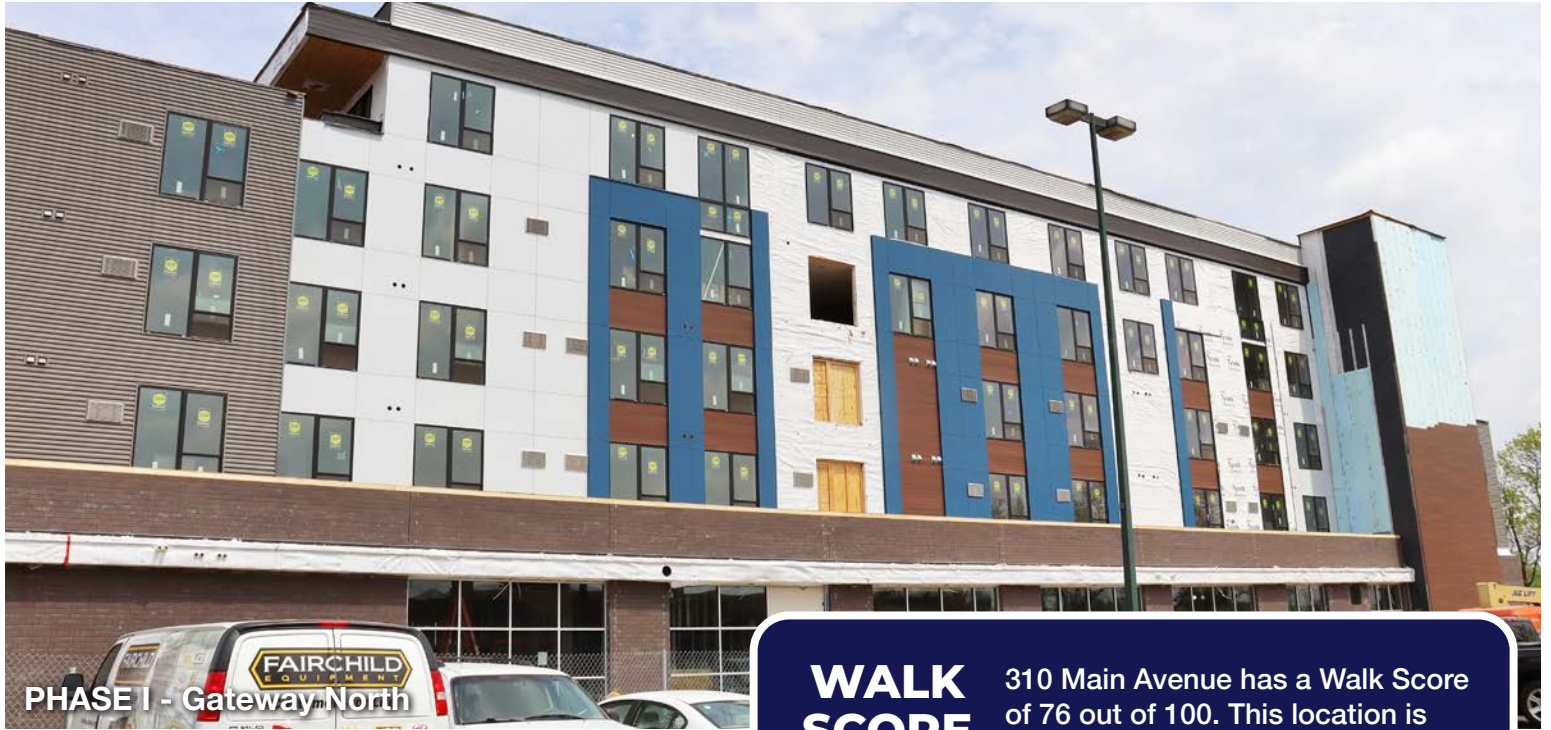
PHASE I - Gateway North